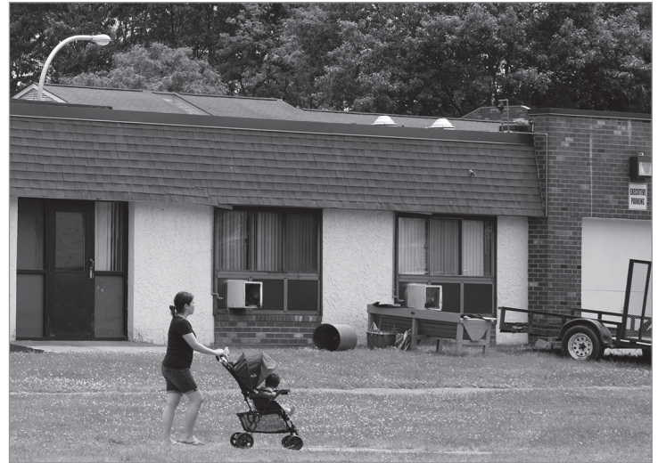
The need for family-based solutions to the opioid crisis is acute in New York's Sullivan County.

The inaugural event of the project was a meeting on October 3 and 4 at UHF that brought together some 40 specialists in opioid addiction, child development, and family policy, ranging from medical professionals to government officials to representatives of local district attorney offices.