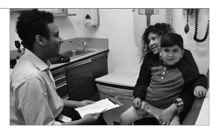
Volunteer navigators are making the connection between Cohen Children's Medical Center and the Child Center of New York better serve vulnerable children and families.

The two groups' close partnership has spurred a range of new synergies and