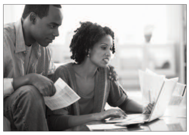
More than 550,000 New Yorkers have signed up for qualified health plans in the initial six-month open enrollment period of the State's insurance exchange.

Unprecedented collaboration among the State and various stakeholders was undoubtedly a key factor in the exchange's successful launch.